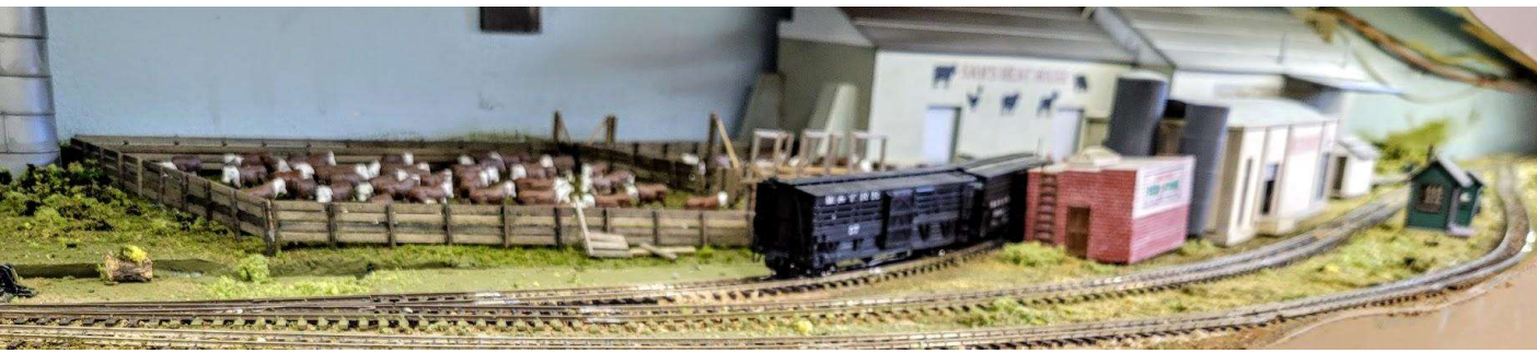
(additional photos follow below)