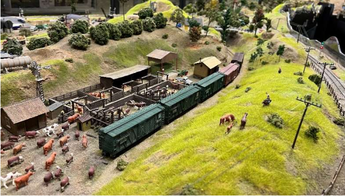
Santa Susana Turn Switching Area – Big D Ranch