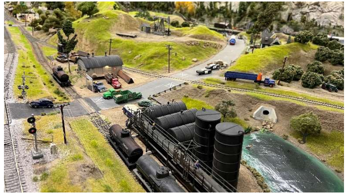
Santa Susana Turn Switching Area – Mobil Oil