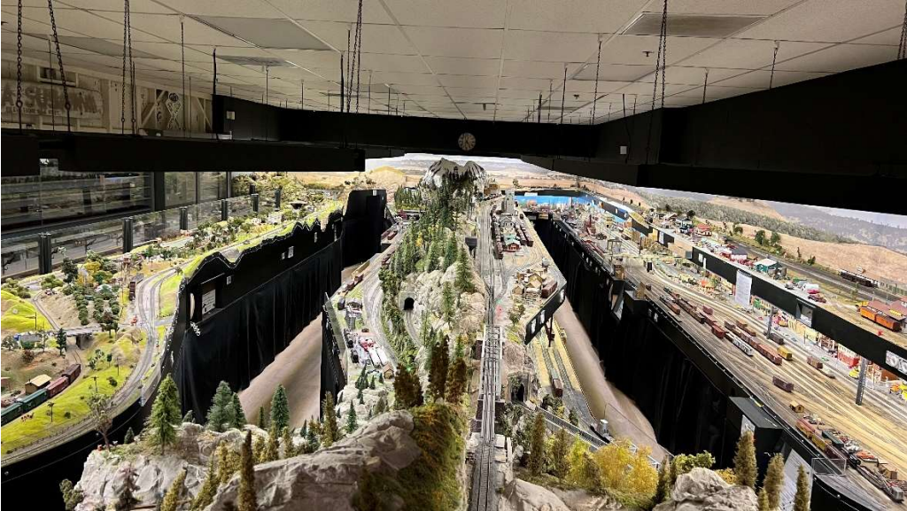
Full Layout View (From Dispatcher's Desk)