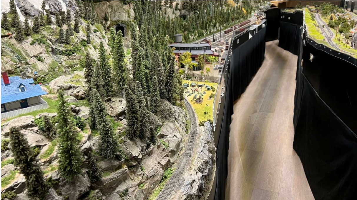
Dunsmuir Yard Aisle