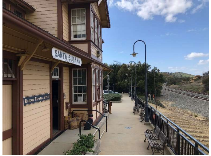
Metrolink / Union Pacific Main Adjacent To Depot