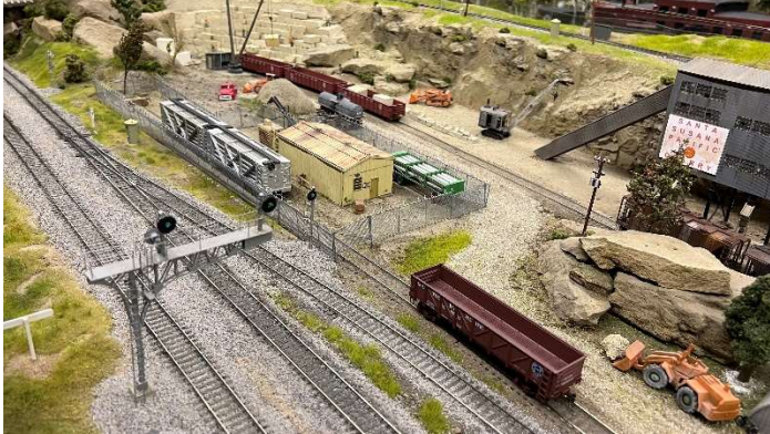
Santa Susana Turn Switching Area – Helium Spur