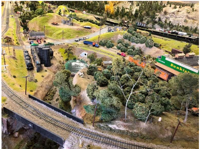
Portion Of Santa Susana Turn Switching