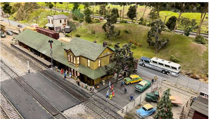
Santa Susana Turn Switching Area – Depot