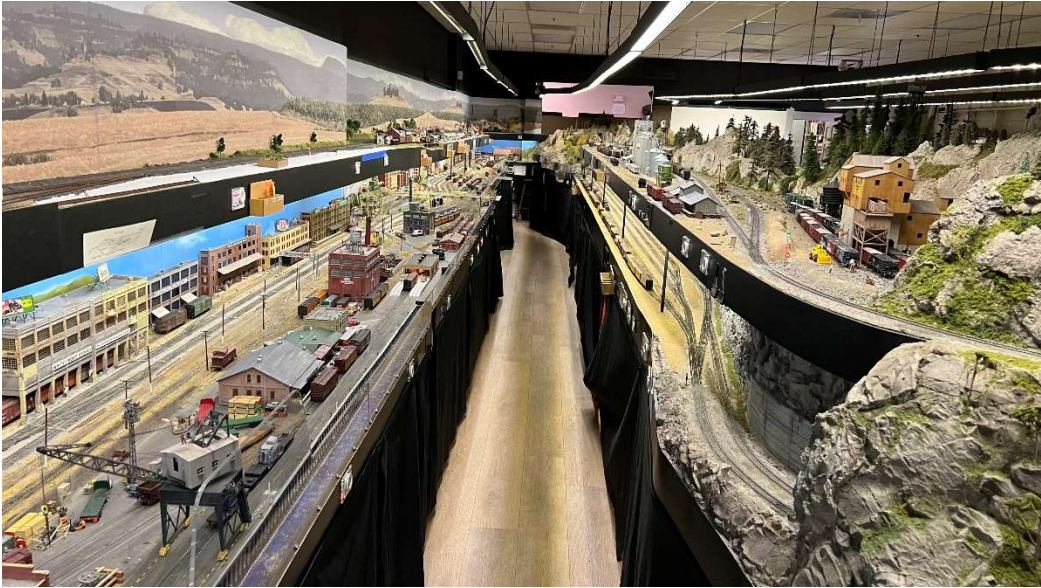
Griffin Yard Aisle