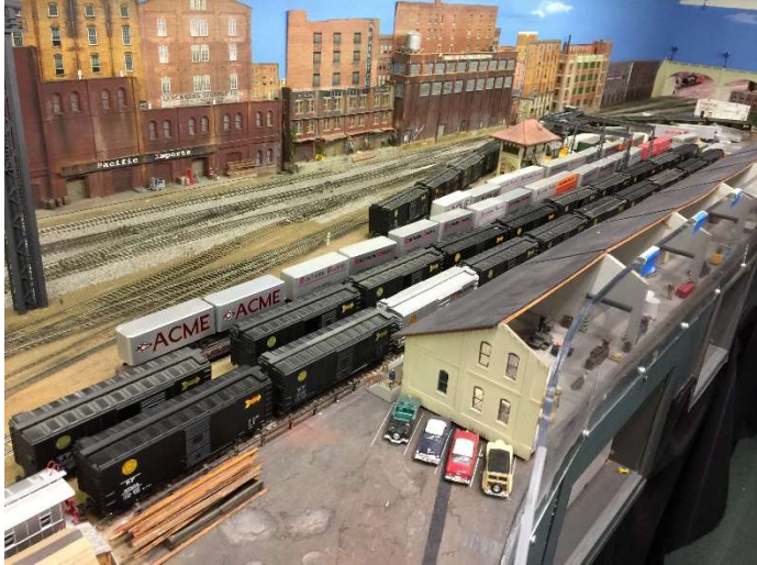
Griffin Yard Freight House & TOFC Facility