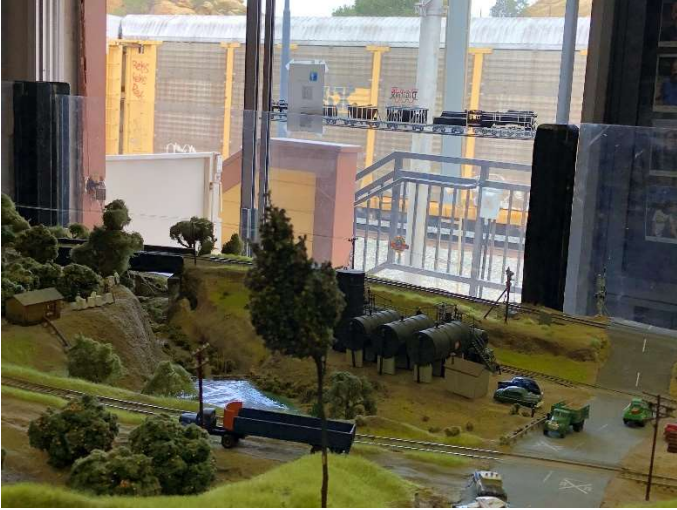
Santa Susana With 12" To The Foot Train Passing By