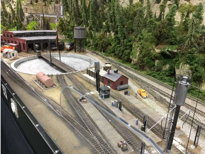
Dunsmuir Turntable & Roundhouse