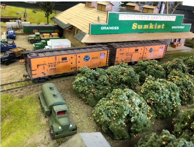
Tapo Citrus (One Area Worked By Santa Susana Turn)