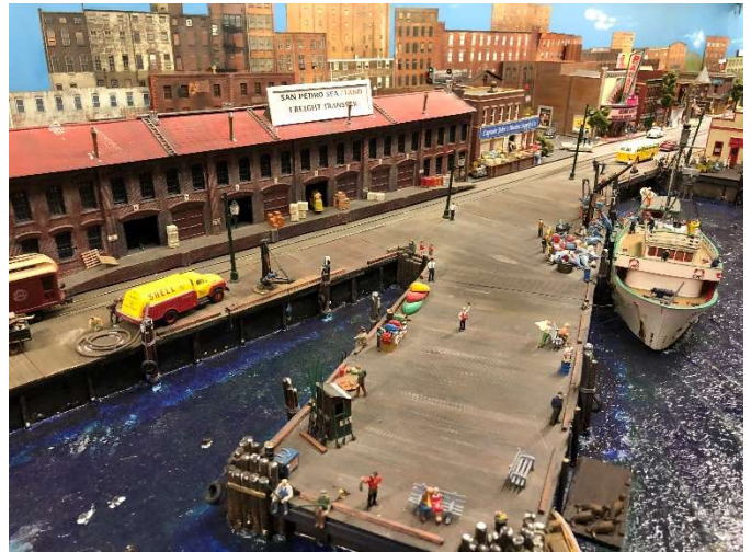
Freight Transfer (One Area Worked By San Pedro Job)

Professionally Produced TSG Multimedia Video (produced in 2023) link: