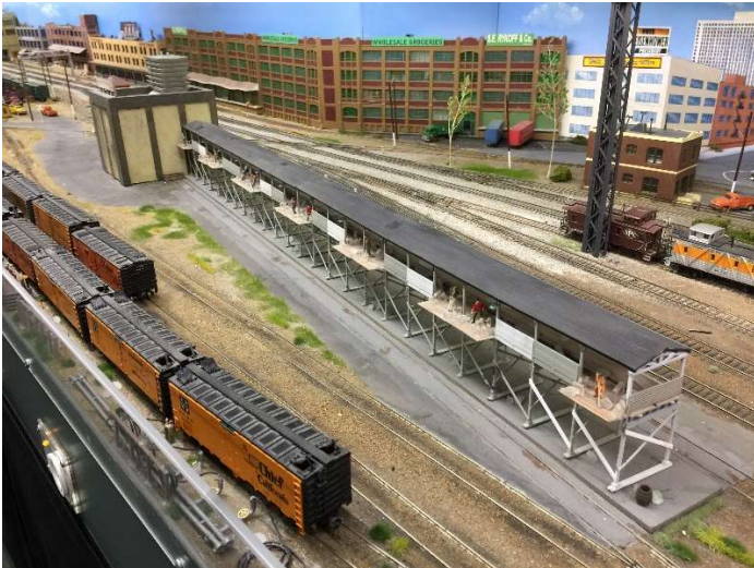
Union Ice Deck