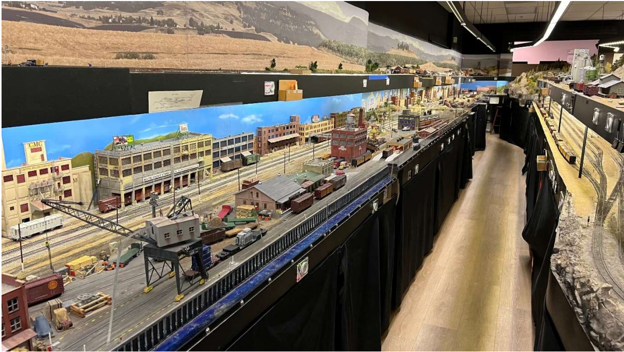
San Pedro Industrial Switching Area (Partial View)